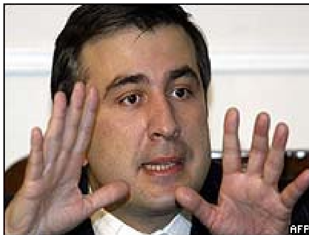
Saakashvili – under Pressure?

money transfers violates International Monetary Fund regulations; transfers are often made through non-Russian companies such as Western Union; and Georgians in Russia might be driven to bypass such regulations anyway by wiring money through other states such as Armenia or Ukraine.